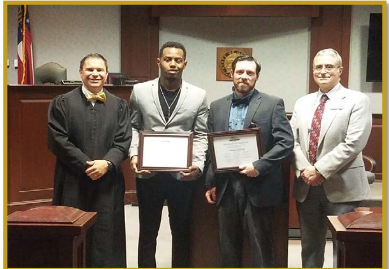
Photo Grid: Judge Ozburn and Judge Benton congratulate Newton and Walton County Resource Court graduates. Right Photo: Judge Thompson is photographed with Fayette County DUI Court graduates.